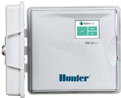
Pro-HC Controller 6-, 12-, and 24-station count