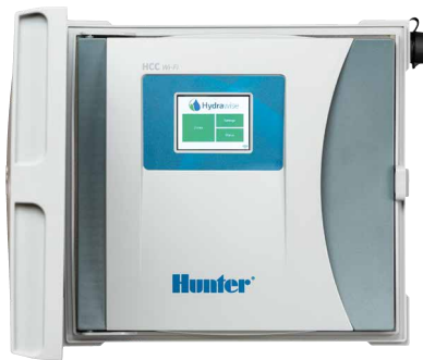
HCC Controller 8- to 54-station count, EZDS two-wire option