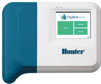
HC Controller 6- and 12-station count

Smart WaterMark Recognised as a responsible water-saving tool