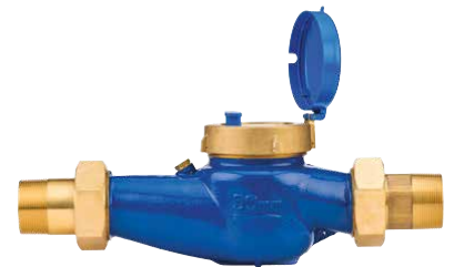
HC Flow Meter Add an optional flow meter to receive flow alerts and monitor water consumption