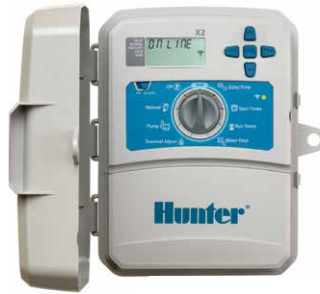
X2 Controller with WAND Module 4-, 6-, 8-, and 14-station count