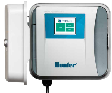
HPC Controller 4- to 16-station count