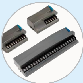
Station Expansion Modules