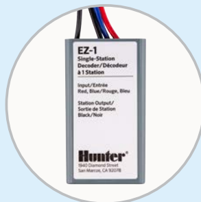
EZ Decoder System