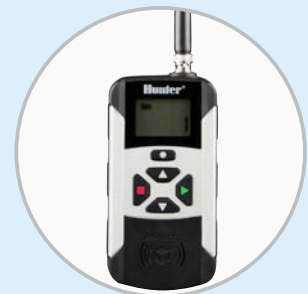
ROAM XL Remote

Hunter Industries is committed to manufacturing top-quality products that use only the water and energy needed to get the job done efficiently. Learn more at hunterindustries.com .