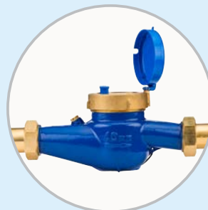
HC Flow Meter